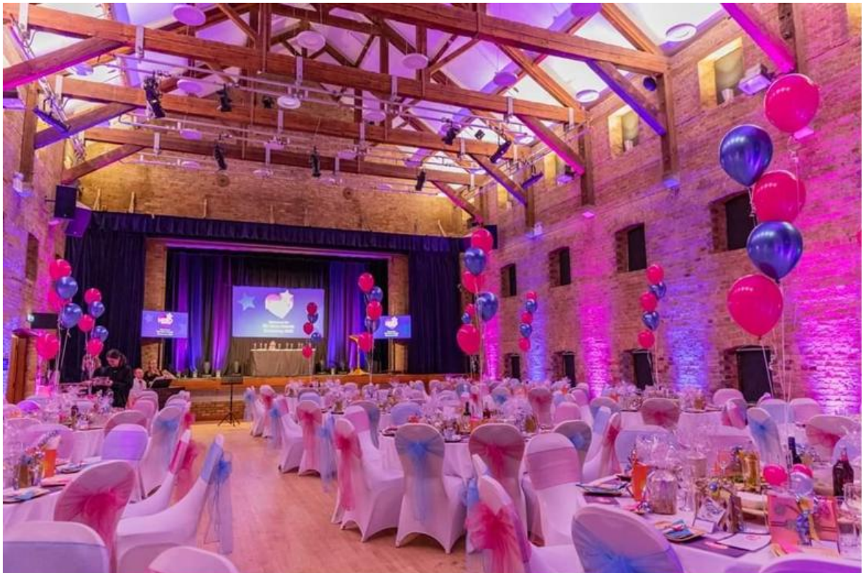
The Elysian Hall

We are happy to accommodate your preferred layout and can allow room for a good size dance floor.