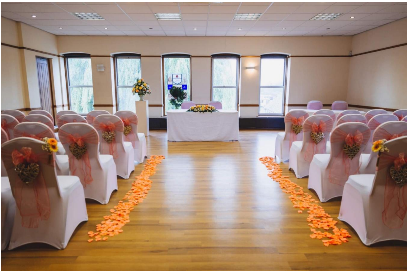
The Kempen Room

The walls and ceiling can be draped at a bespoke cost to transform the entire space.